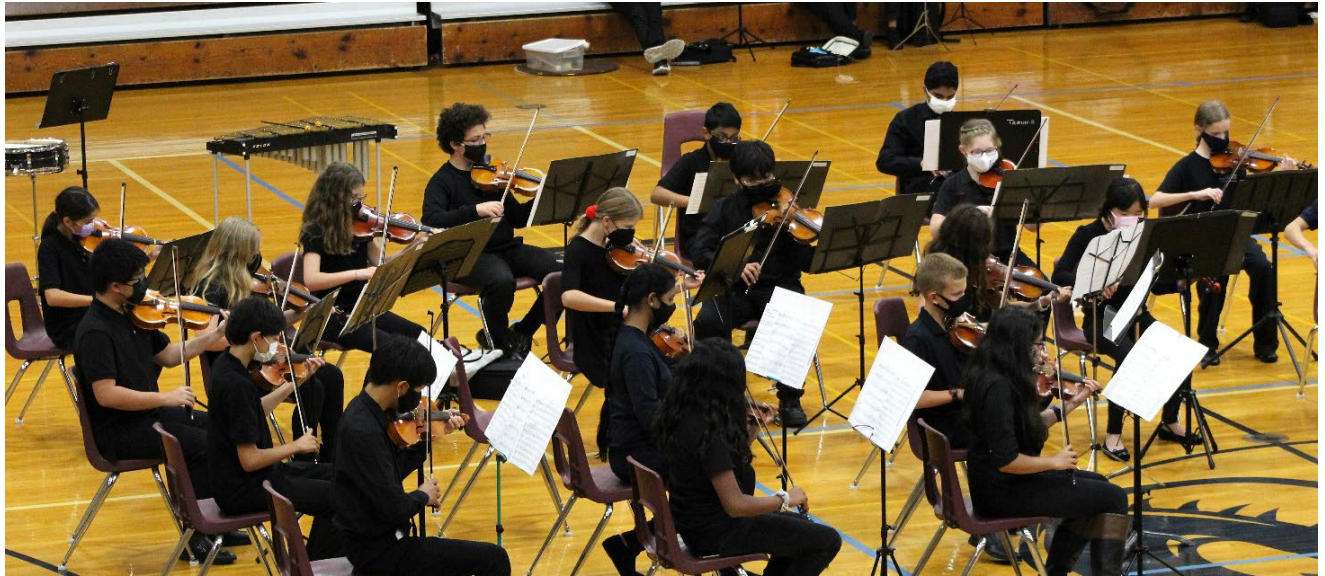
Sinfonia performs at the Fall Gala in the PARC Gym, October 19, 2021.